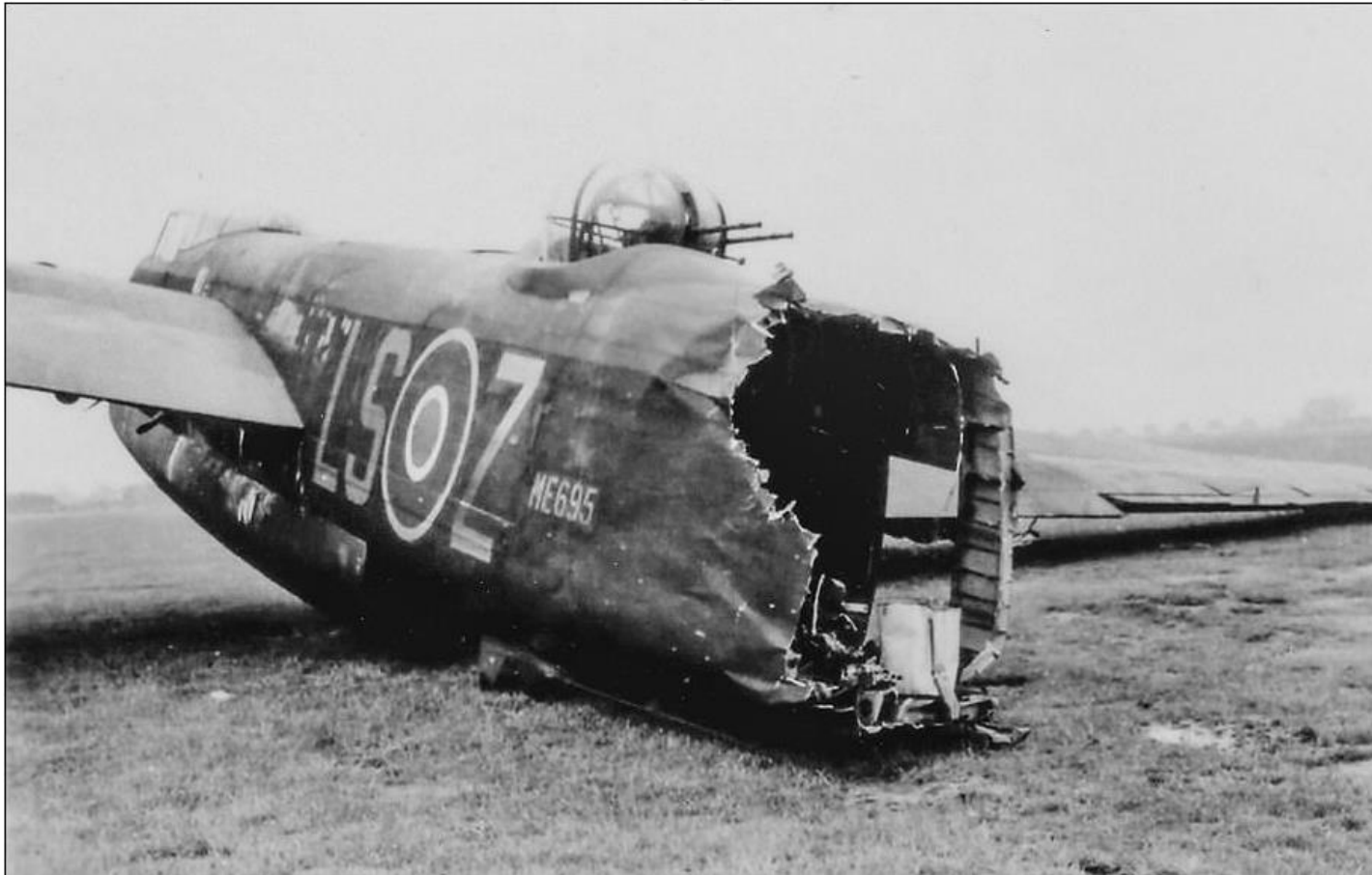
The wreckage of an Avro Lancaster of XV Squadron from the rear port side, which crash-landed on the Fighter Command airfield at RAF Ford, Sussex, on June 30, 1944. The rear gunner lost his life in the practice manoeuvre when two planes collided while getting into formation. The plane was crash-landed with no further loss of life